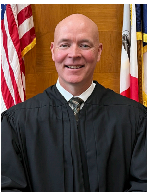
District Court Judge Ian K. Thornhill

After appointment to the bench, Judge McPartland served on the Iowa Civil Justice Reform Task Force from 2009-2012 and contributed to the 2012 report of the Task Force. Judge McPartland also served as a member of the Advisory Committee Concerning Certain Civil Justice Reform Task Force Recommendations beginning in 2012, with the work of the Committee leading to the adoption of 2015 amendments to the Iowa Rules of Civil Procedure related to areas including required initial disclosures, discovery, and expedited civil actions. Judge McPartland was appointed in 2017 to serve as a judge on the Iowa Business Specialty Court and served in that capacity until 2020. Judge McPartland also has served regularly since 2012 as a faculty member in orientation programs for new judges presented by the Iowa Judicial Branch.